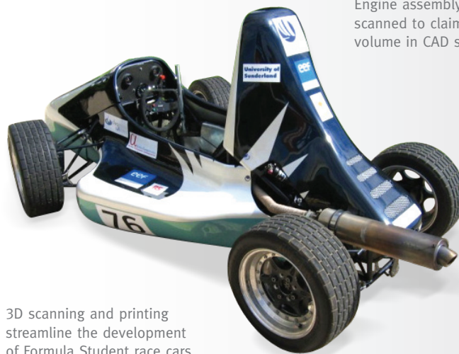
3D scanning and printing streamline the development of Formula Student race cars.