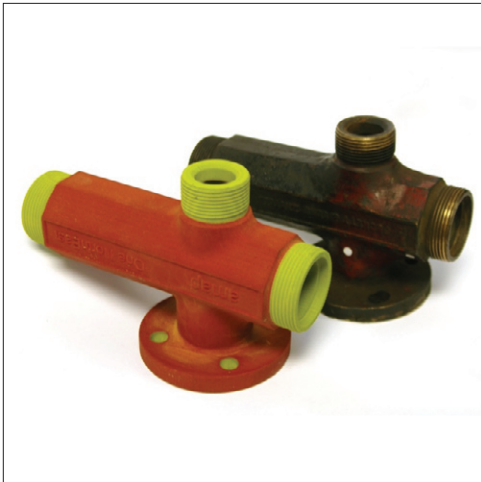
Top: The Digital Factory team used 3D scanning and 3D printing to replace damaged 19th century artifacts at County Durham's Beamish Museum.